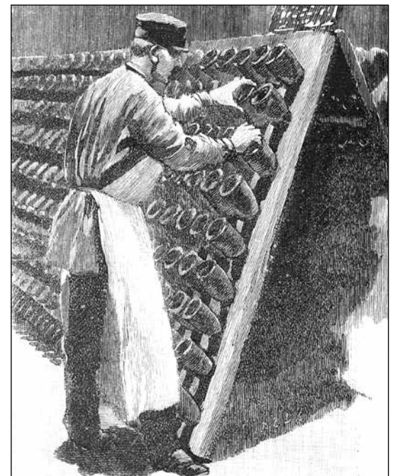
THE "REMUEUR" TURNS APPROX. 30.000 BOTTLES SLIGHTLY EVERY DAY, TO COLLECT DEPOSIT IN THE NECKS OF BOTTLES AGAINST THE CORKS.

bourbon, peach liqueur, sugar, Angostura bitters 10,50 €